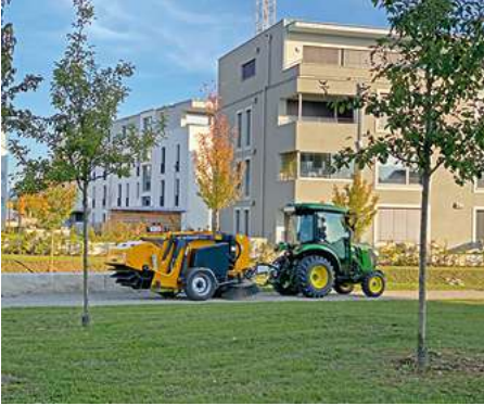
Senior 2000 Sweeper